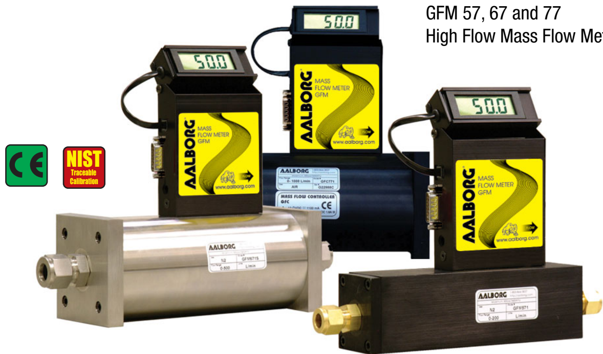
GFM 57, 67 and 77 High Flow Mass Flow Meters