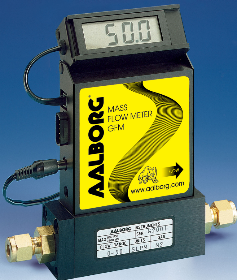
Typical Aluminum GFM Mass Flow Meter