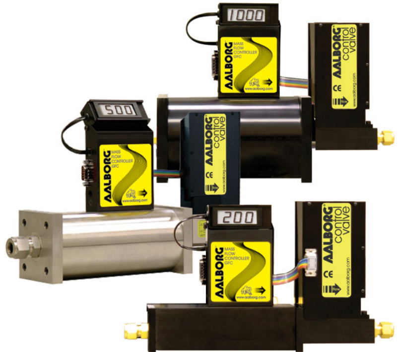
TABLE 25 - ACCESSORIES FOR GFC